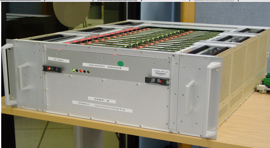
Single Slot Back Plane (SSBP8 and 9)