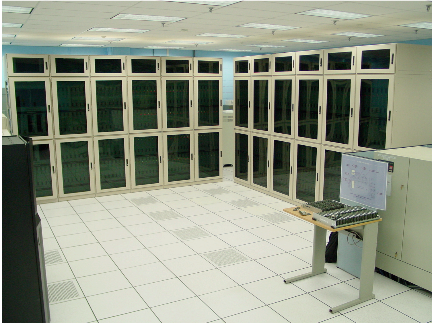
RBRC (right) and DOE (left) 12K-node QCDOC machines